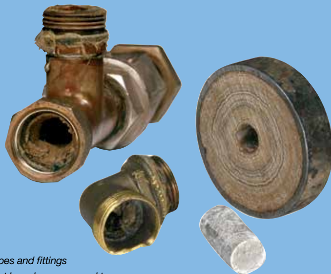
Pipes and fittings that have been exposed to calcareous water for a long time.