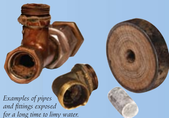
Examples of pipes and fittings exposed for a long time to limy water.

The Aqua Decalcifier contains no movable parts and is totally maintenance free. It is tested by Assistant Professor docent Allan Jerbo. Test report and references are available on request.